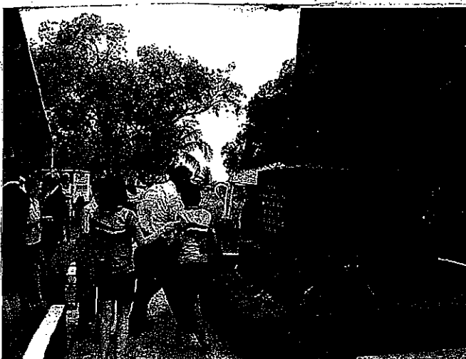
School children laying flowers at the memorial