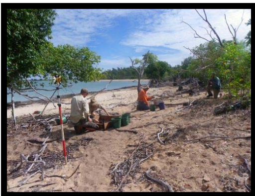
The dig at of Fort Wellington