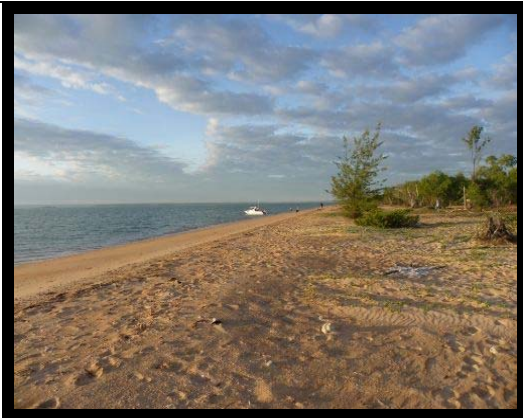
Fort Wellington beach where we camped

The finding of Fort Wellington has been an interesting, constructive and very entertaining project for the Society some 45 years after the Society rediscovered the settlement site.