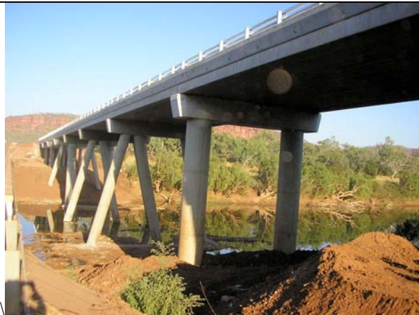
The Victoria River Bridge