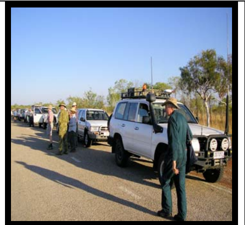
At Army Headquarters