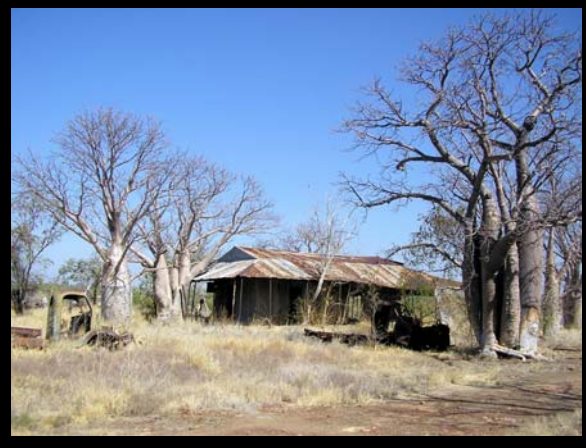
The original Bradshaw Homestead