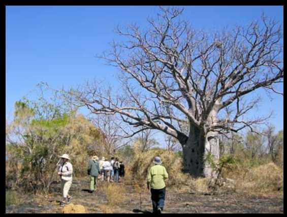
Finlay's Grave Boab