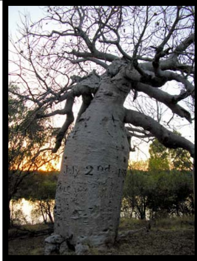
Augustus Gregory's Tree inscribed 2 July 1856. Gregory established a camp on the Victoria River in 1855