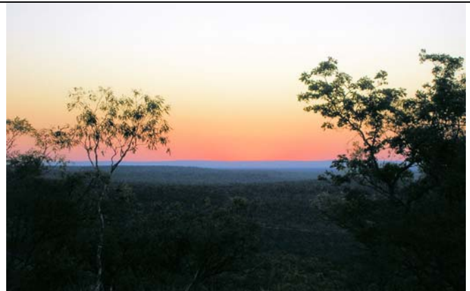
Sunset at Naccaroo Lookout near Timber Creek