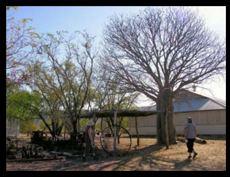
The old Timber Creek Police Station

Besides visiting Bradshaw Station, we managed to find time to explore the surrounding district.