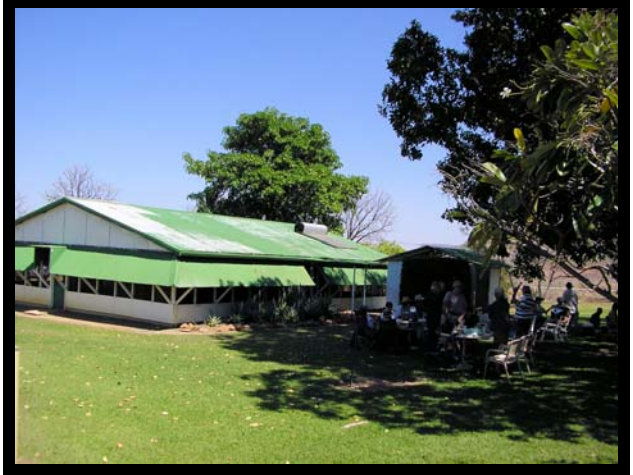
Lunch on the lawns of a later homestead.