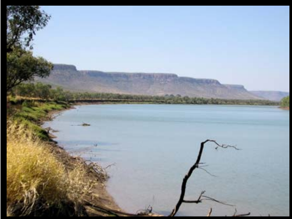
the Angalarri River

The following days took in the Ikymbon River and the Koolendong Valley areas and the scenery was magnificent and constantly changing.