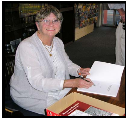
Eve book signing