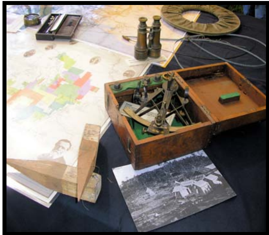
Some of Goyder's tools on display