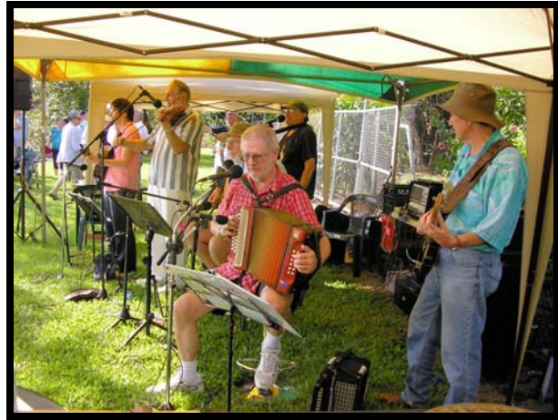
The Moonta Revellers

The re-enactment was carried out by the Office of the Surveyor-General, Department of Lands and Planning staff.