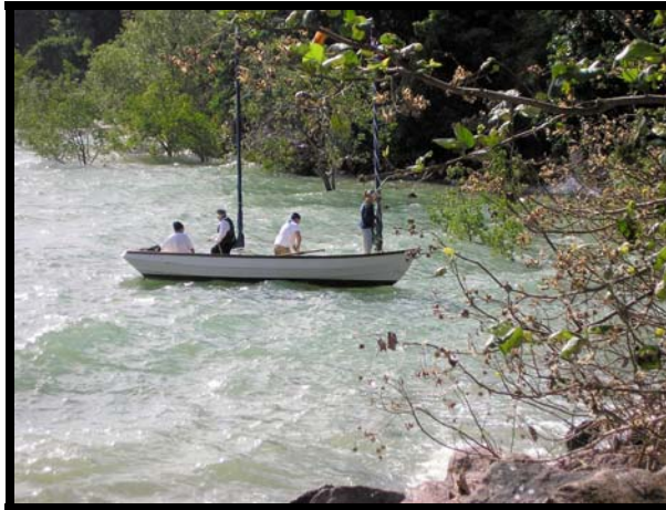
"Goyder's Party" arriving at Port Darwin.