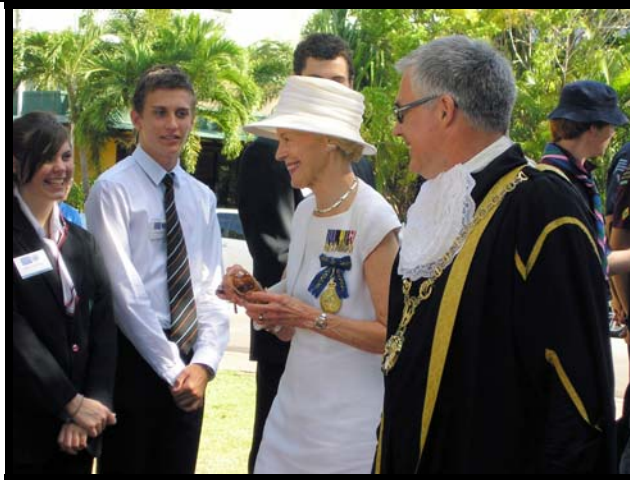
The Governor General, Quentin Bryce speaking with Darwin High School students