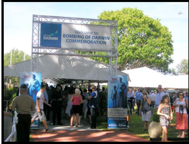
The entrance to the Cenotaph