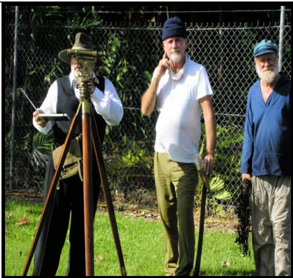
Goyder and his party "surveying Darwin"