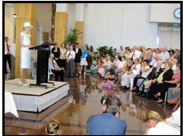
The Governor General addressing the audience at the 70th Commemoration of the Bombing of Darwin reception. The Prime Minister is in the background.