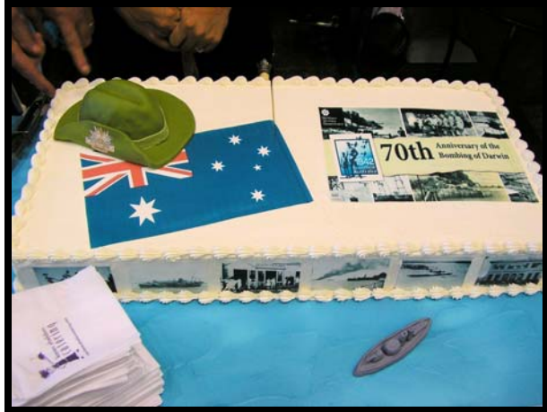
The 70th Commemoration cake

After the Service, the Chief Minister held a 70th Commemoration of the Bombing of Darwin reception in Parliament House for veterans and their families. This was also attended by the Governor General and the Prime Minister.