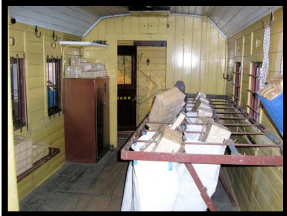
Inside the mail van