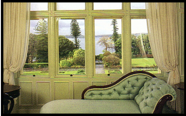
The view of Sydney Harbour and gardens from the Queen's Suite