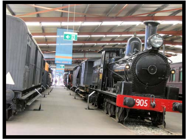
Some of the many carriages and engines in the great hall