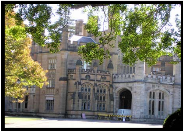
The entrance to Government House

In 1788 with the arrival of the First Fleet, the first Government House was a makeshift canvas "house" but later in 1788, convicts commenced the construction of a two – storey brick residence in Bridge Street . This Government House went on to serve the first nine Governors – Phillip to Gipps. In 1816, Governor Macquarie commissioned architect Francis Greenway to design the current Government House. Government House was built between 1837 and 1845, and has since hosted many dignitaries including Queen Elizabeth and Prince Phillip. Inside the drawing room is a showcase of contemporary Australian art, craft and design. Throughout the building is a wonderful collection of colonial furniture, portraiture and furnishings by leading Sydney craftsmen and artists. The grounds contain beautiful gardens with exotic plants, fountains, a gate house, stables a gothic style chalet, and the original carriageway to the residence. Free tours run half hourly on most weekdays and it is well worth the visit.