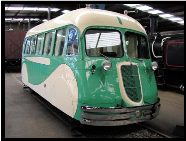
The Rail Pay Bus which was robbed

Engines range from steam, coal, diesel - to the modern electric locomotion. On boarding a Spirit of Progress van and a 1960s dining carriage, childhood memories were evoked on the sight of opulent leather upholstery, metal pull down basins and solid wood furnishings.