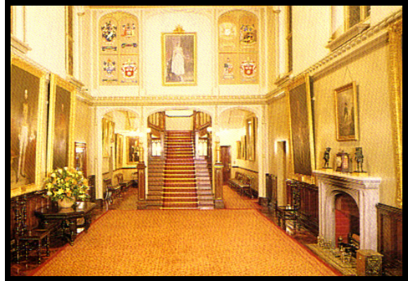
The Main Hall