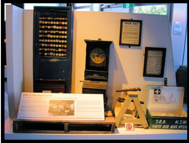
A couple of the displays