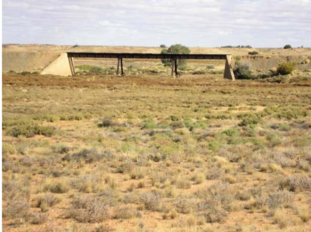
The Breakfast Time Creek Railway Bridge, William Creek