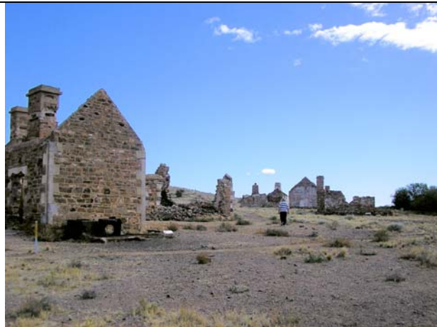
The Peake OLT station, mess and mens quarters