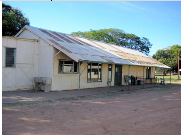
VRD social club bar. We had a drink with some of the ringers.