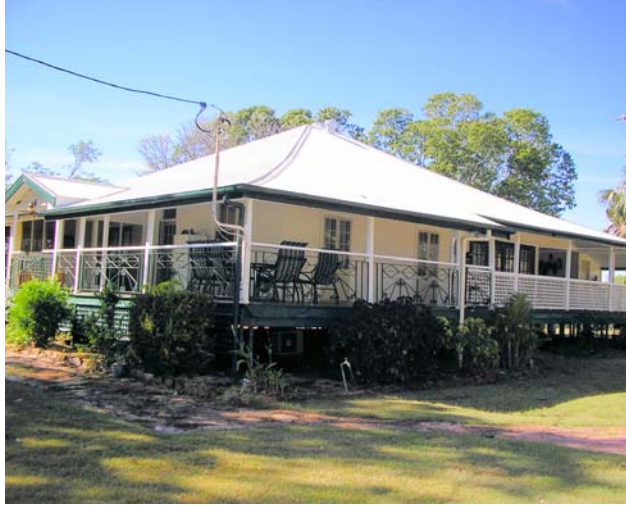
The beautiful old homestead completely renovated inside and extended. C.1910