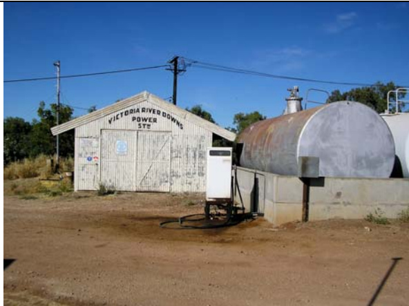
VRD power station