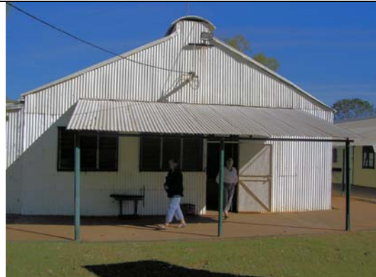
The old Stores building which closed in 2006. Contains a bomb shelter and now partly used as a weather station.