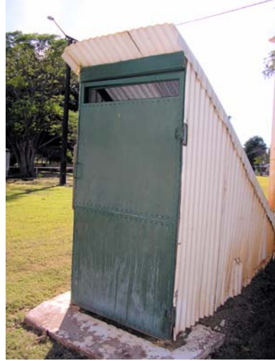
WW2 bomb shelter