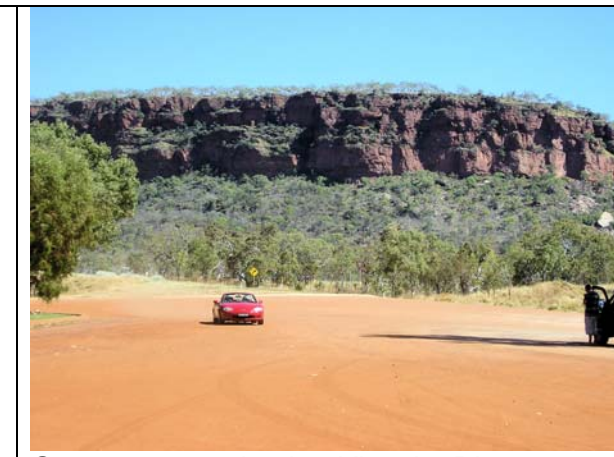
Great scenery in the Victoria River region