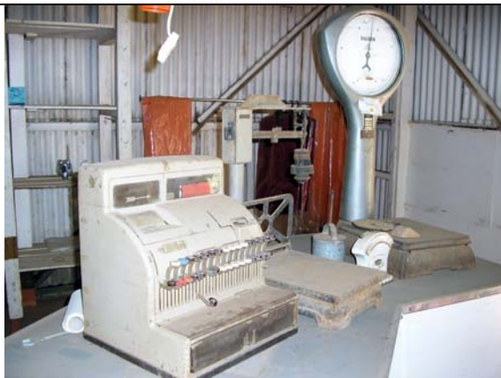
Inside the old Stores building