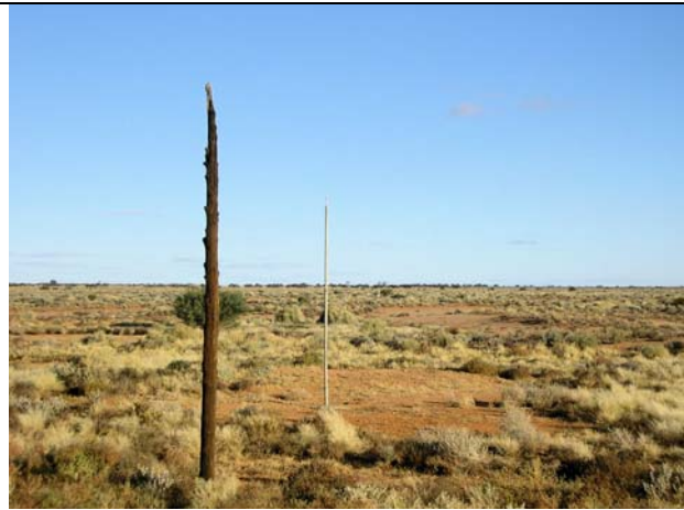
Original wooden & Oppenheimer OHL poles near William Creek