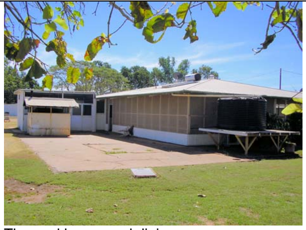
The cookhouse and dining room