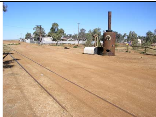
The end of the Oodnadatta railway line