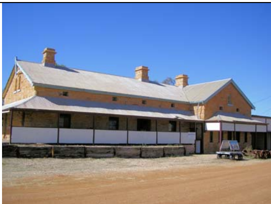
Oodnadatta railway museum