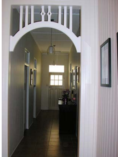
Some of the stunning woodwork inside the homestead