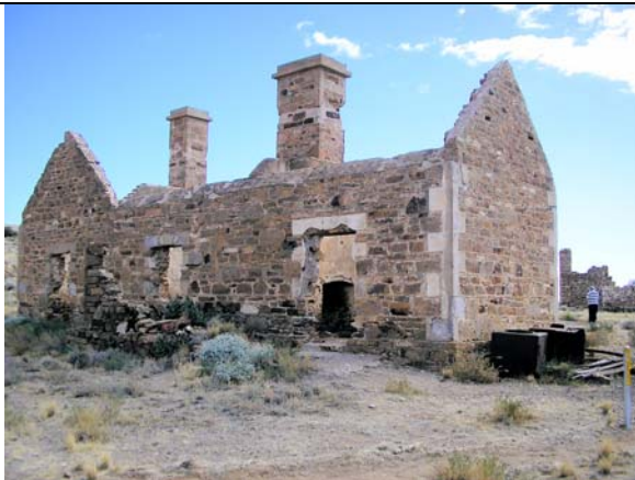
The telegraph station.

High above the salt plains and 20km (30 mins travel one way) off the Track is the Peake Overland Telegraph Station which began operation in 1872. John McDouall Stuart had passed through the area during the 1850s and considered that gold could be found in the area. However it was to be copper that was mined. The mine and excavation are still very evident. Other remnants consist of outdoor toilet, smithy's workshop, wagon wheels, tools, an iron wrought bed, iron square water tanks and tin buckets.