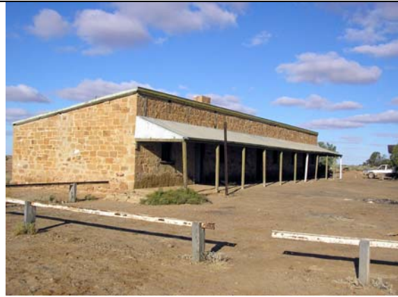
Beresford Railway Siding on Anna Creek Station