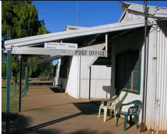
VRD post office – post code 0852