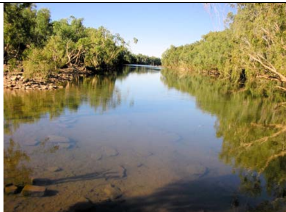
Our camp was at the stunning Wickham River. Tempting but much too cold for a swim