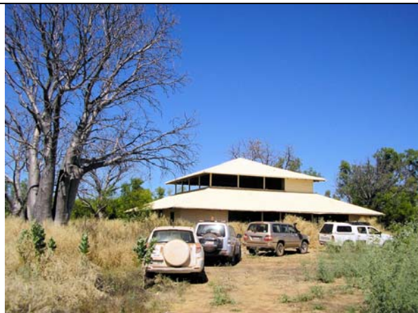
The old hospital – Wimmera House