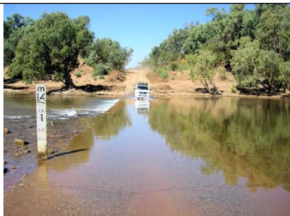
Dashwood Xing at the Victoria River. Lyn and Brian Reid's 4WD coming through

The following are some photos from our trip.