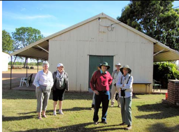
Front of the post office