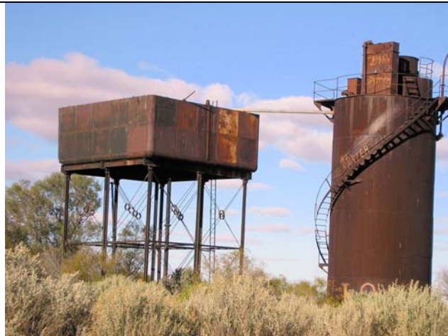
Beresford Railway Siding elevated water tank