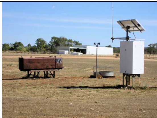
The weather station. Note the old iron water tank