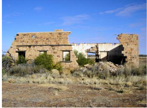
Warrina Railway Siding

High above the salt plains and 20km (30 mins travel one way) off the Track is the Peake Overland Telegraph Station which began operation in 1872. John McDouall Stuart had passed through the area during the 1850s and considered that gold could be found in the area. However it was to be copper that was mined. The mine and excavation are still very evident. Other remnants consist of outdoor toilet, smithy's workshop, wagon wheels, tools, an iron wrought bed, iron square water tanks and tin buckets.